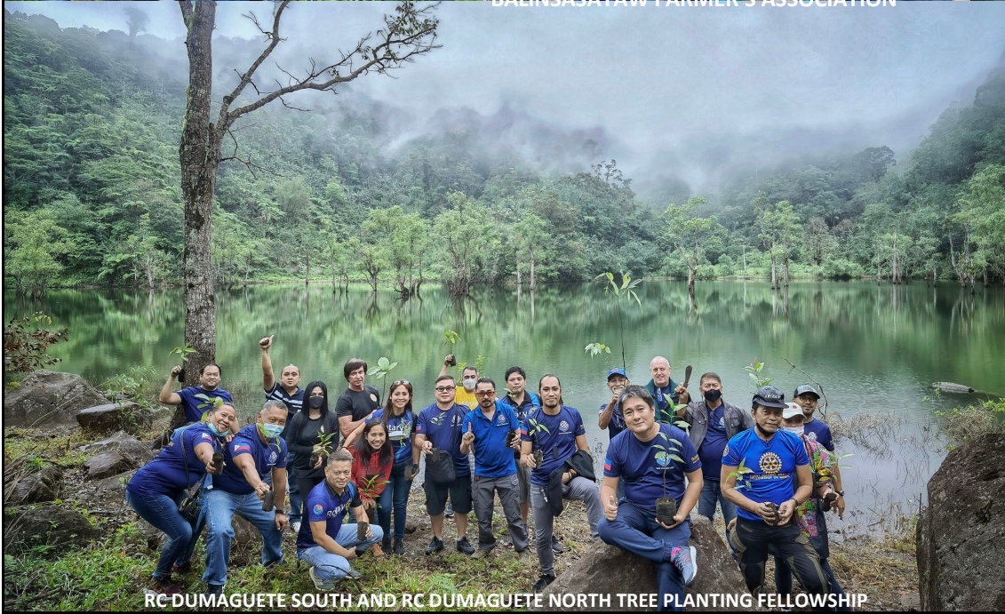
RC-DUMAGUETE SOUTH AND RC DUMAGUETE NORTH TREE PLANTING FELLOWSHIP