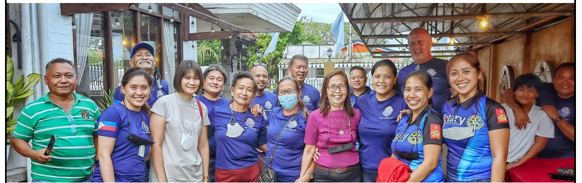
RC DUMAGUETE SOUTH AND RC DUMAGUETE NORTH FELLOWSHIP