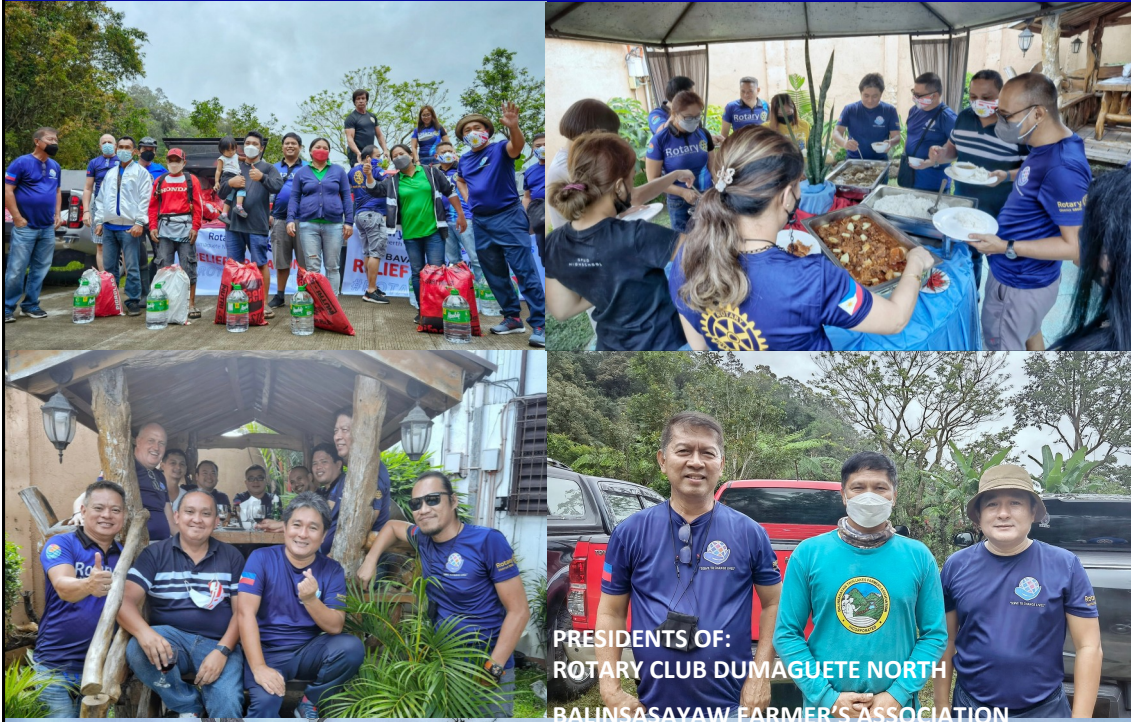
PRESIDENTS OF: ROTARY CLUB DUMAGUETE NORTH BALINSASAYAW FARMER'S ASSOCIATION